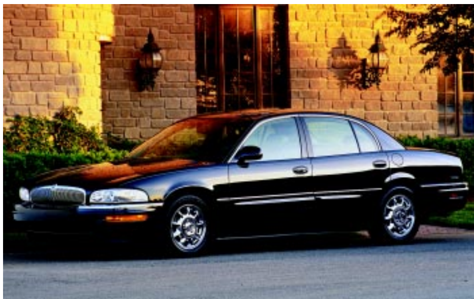
Park Avenue Ultra