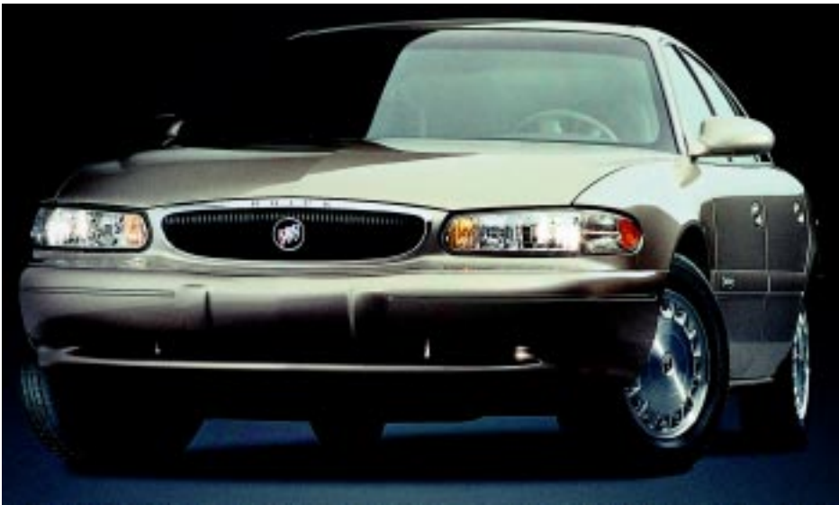
Century 2000 Special Edition